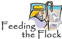
Feeding the Flock